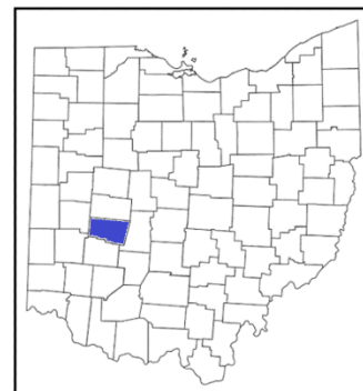
Figure 1. Clark County